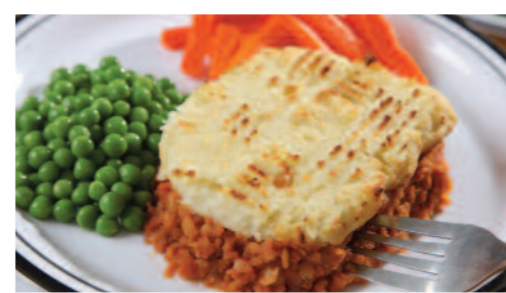
Meat Free Cottage Pie served with Seasonal Vegetables & Gravy