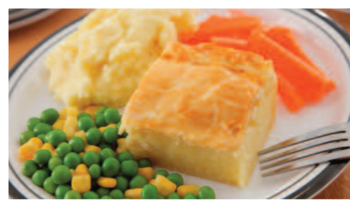
Cheese & Potato Pie & served with Roast & Mashed Potatoes & Seasonal Vegetables