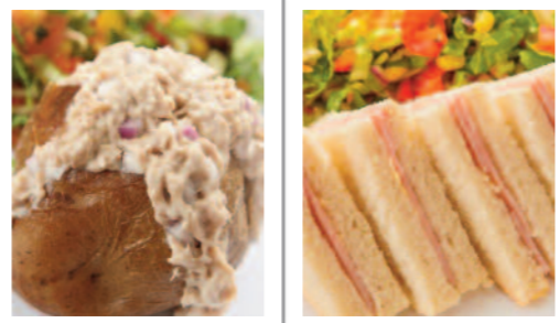
Filled Jacket Potato/Deli with a Selection of Fillings. Served with a Side Salad