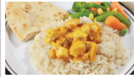
Fruity Chicken Curry served with Rice, Naan Bread & Seasonal Vegetables