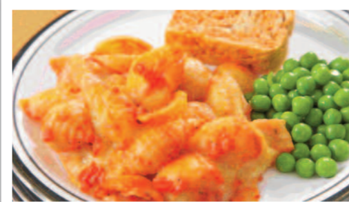
Tomato & Cheese Pasta with Crusty Bread