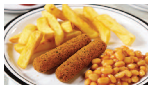
Breaded Mozzarella Sticks served with Chips & Peas or Baked Beans