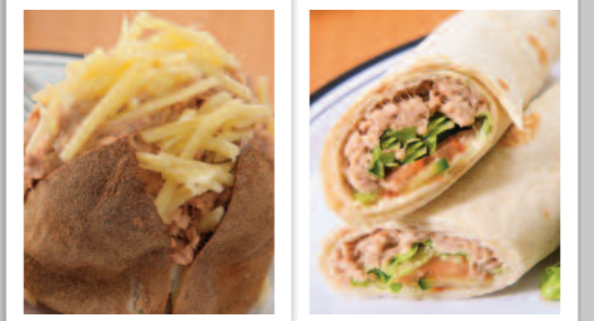
Filled Jacket Potato/Deli with a Selection of Fillings. Served with a Side Salad