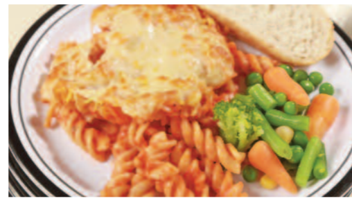
3 Cheese & Tomato Pasta served with Garlic & Herb Bread and Seasonal Vegetables