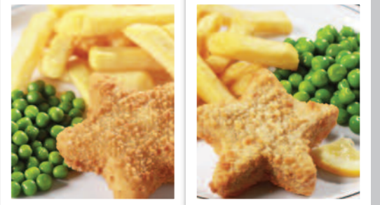
Salmon/Cod Fish Star (MSC) served with Chips & Peas or Baked Beans