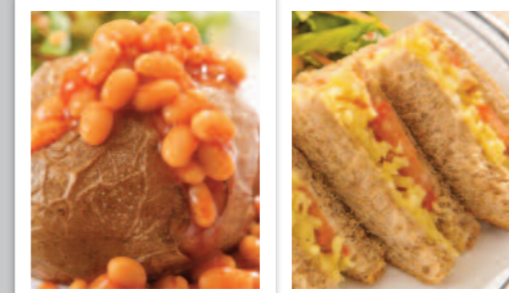
Filled Jacket Potato/Deli with a Selection of Fillings. Served with a Side Salad