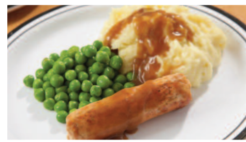
Quorn Sausage served with Mashed Potato, Seasonal Vegetables & Gravy