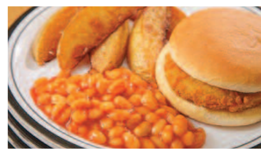
Vegetarian Burger Served with Potato Wedges, Seasonal Vegetables & Gravy