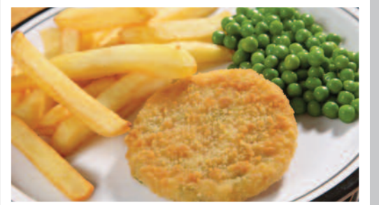
Vegetable Grill served with Chips and Peas