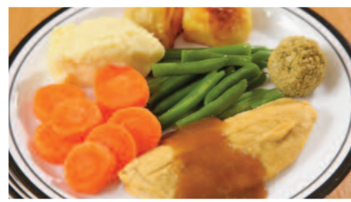
Vegetarian Roast Lunch served with Roast & Mashed Potatoes Seasonal Vegetables & Gravy