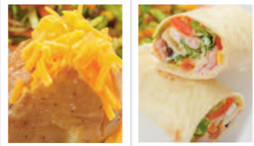
Filled Jacket Potato/Deli with a Selection of Fillings. Served with a Side Salad