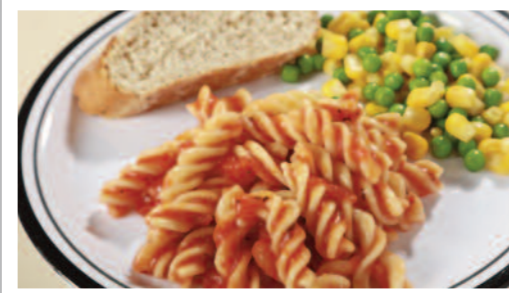
Tomato & Basil Pasta served with Crusty Bread