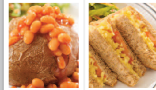
Filled Jacket Potato/Deli with a Selection of Fillings. Served with a Side Salad