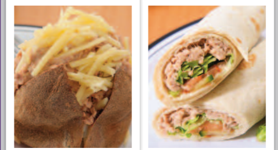
Filled Jacket Potato/Deli with a Selection of Fillings. Served with a Side Salad