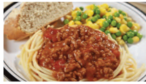
Spaghetti Bolognese served with Garlic & Herb Bread and Seasonal Vegetables