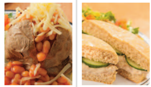
Filled Jacket Potato/Deli with a Selection of Fillings. Served with a Side Salad