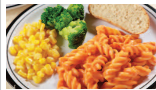
Tomato & Mascarpone Cheese Pasta served with Garlic & Herb Bread and Seasonal Vegetables