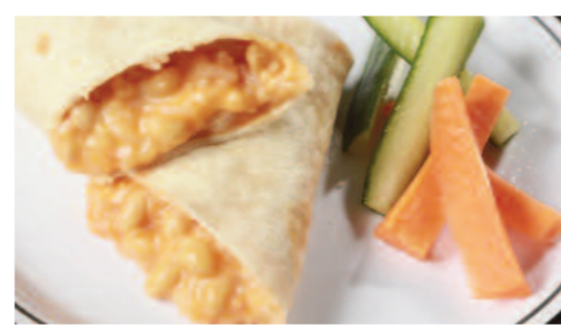
Hot Cheese & Bean Wrap served with Carrot & Cucumber Sticks