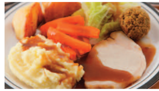
Roast Pork served with Roast/Mashed Potatoes, Seasonal Vegetables & Gravy