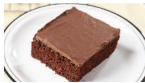
Iced Wacky Chocolate Cake