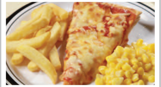
Cheese & Tomato Deep Pan Pizza served with Chips & Baked Beans