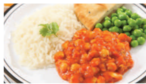
Lentil & Vegetable Curry served with Rice & Seasonal Vegetables