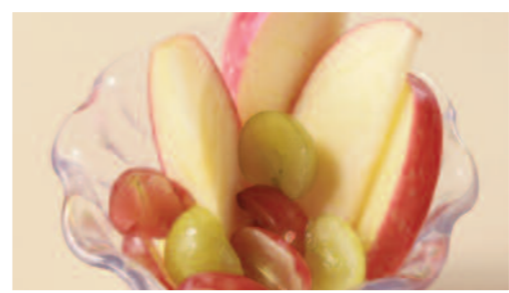
Apple & Grape Pot