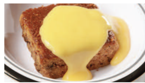
Sticky Toffee Pudding served with Custard