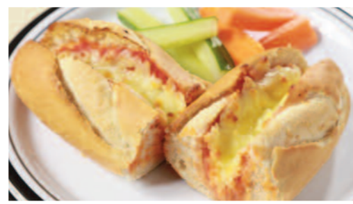
Hot Pizza Baguette served with Carrot & Cucumber Sticks