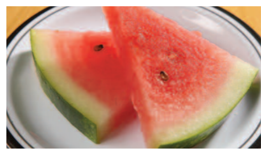
Fresh Water Melon Wedge