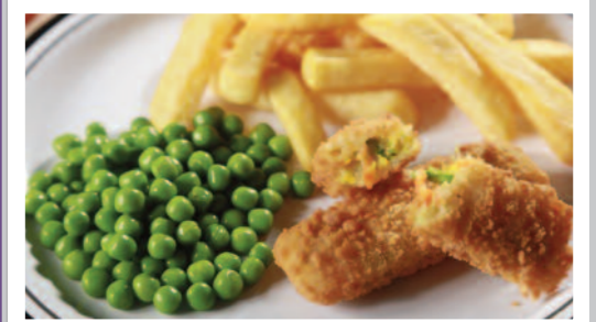
Vegetable Fingers with Chips & Baked Beans or Peas