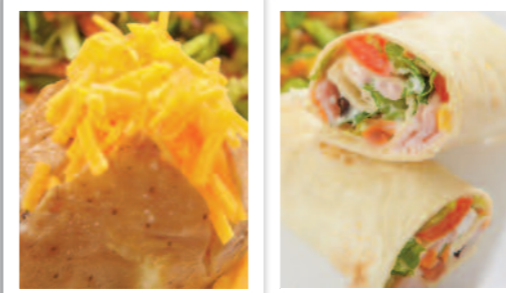
Filled Jacket Potato/Deli with a Selection of Fillings. Served with a Side Salad