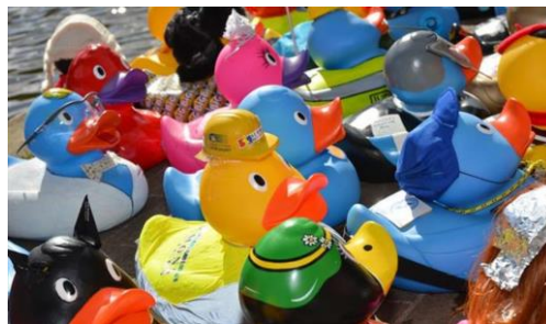
Duck Race at the River Dee, The Groves, Chester on Saturday 9 th April 2022 at 3pm